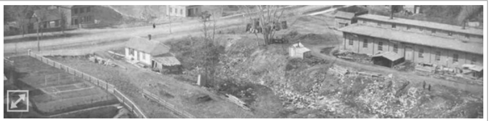
Burlington, circa 1870, ravine in foreground - photo detail